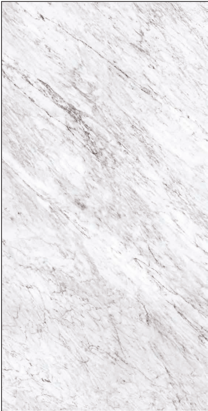
FULL SHEET PATTERN ORIENTATION