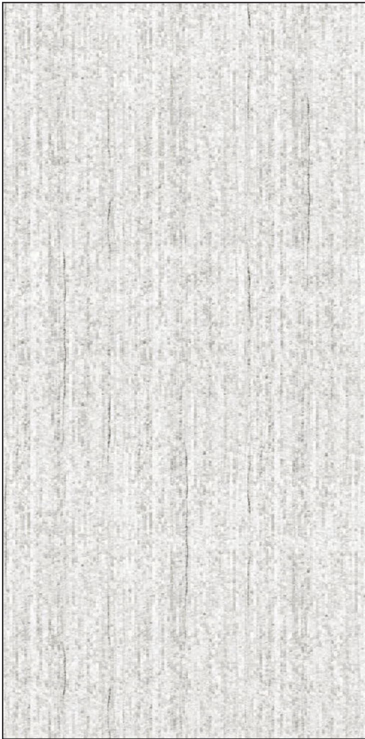
FULL SHEET PATTERN ORIENTATION