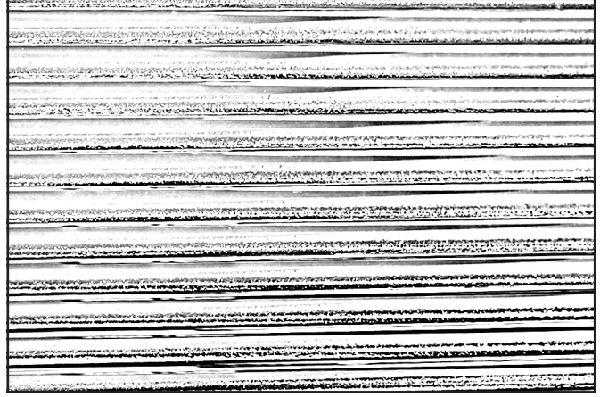
TEXTURE DETAIL 1:1

NOTE: THE ABOVE ILLUSTRATION IS FOR ORIENTATION ONLY. ACTUAL PATTERN MAY VARY FROM PATTERN SHOWN.