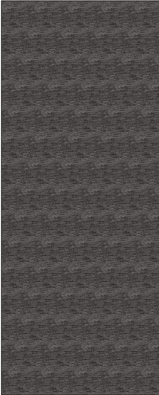
FULL SHEET PATTERN ORIENTATION

NOTE: THE ABOVE ILLUSTRATION IS FOR ORIENTATION ONLY. ACTUAL PATTERN MAY VARY FROM PATTERN SHOWN.